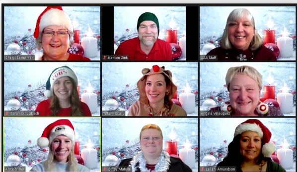
2020 AAA Holiday Zoom Staff Meeting

***Elder Benefit Specialist (EBS) Program