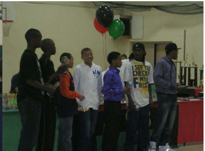
7th Grade Boys Team Get Awards