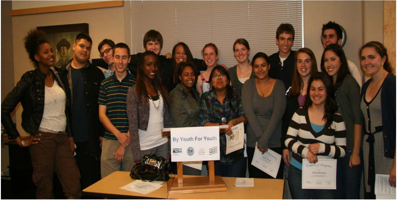
BYFY Committee Members