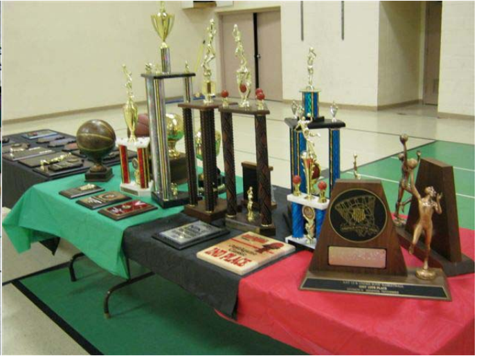
Some of the SpartansTeam's Tourney Championship