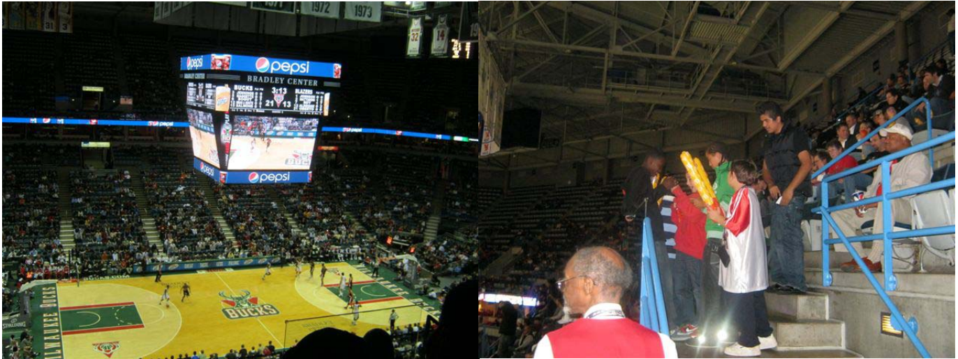
The Bradley Center