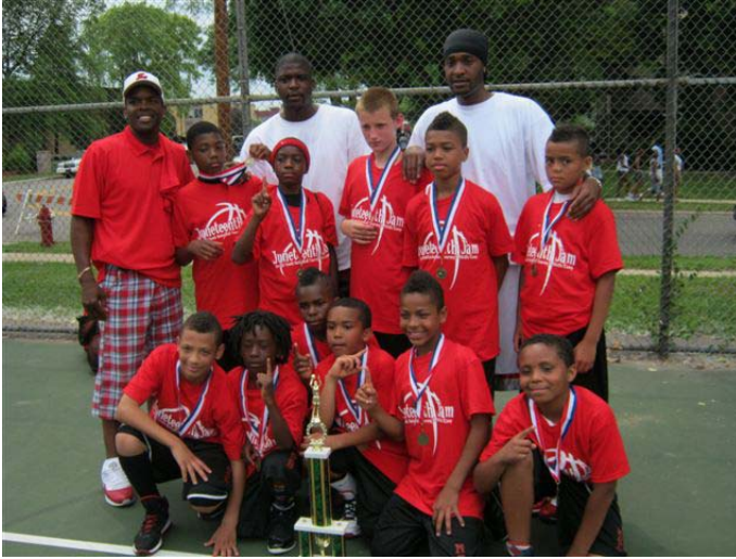
5th Grade Boys Juneteenth Champions