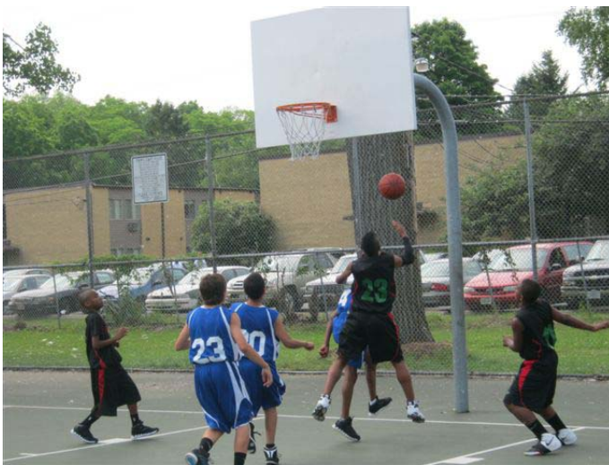
6th Grade Boys Game Action