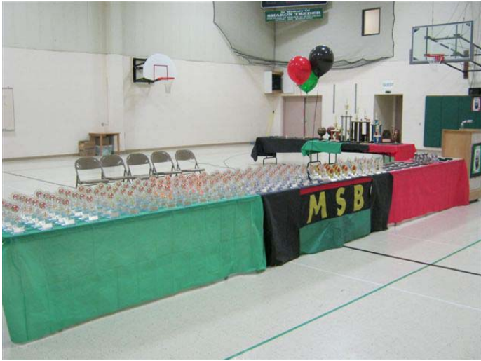
A Look at the Awards Table