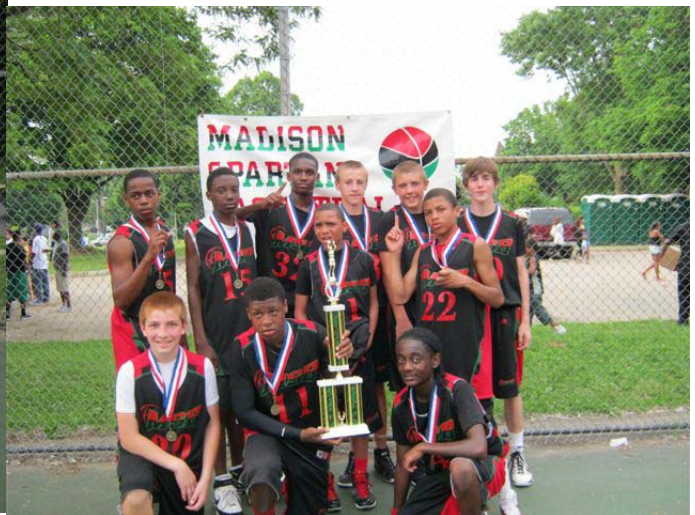
7th Grade Boys Juneteenth Champions